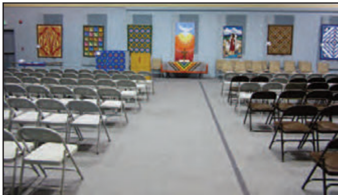
Ready for Sunday morning