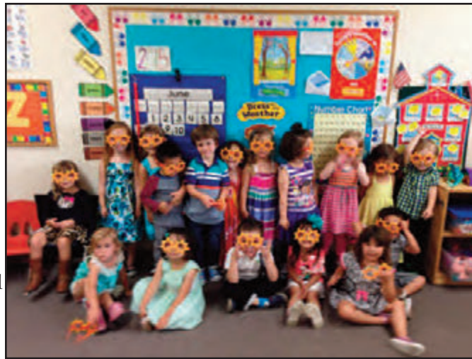
Children in Room 3, with their SUN glasses, ready to sing for their parents

We will be back in summer school on June 23rd with a full house! Only a few spots are still open. Summer school ends on July 30th. Fall registration is going very well. We will start our school year on Aug 18th. We hope you all have a great summer!