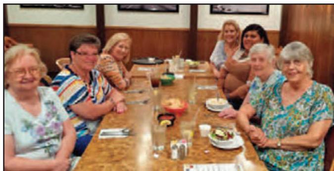
Faith, Hope & Love members enjoying their lunch out.