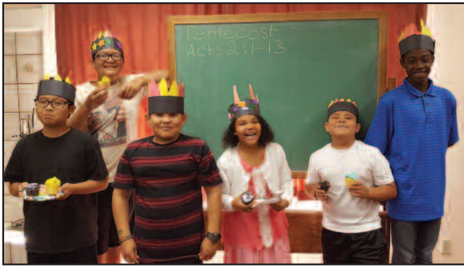
Elementary Sunday School class celebrating Pentecost – the birthday of the church